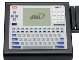
M7140 with Factory Installed MSR/Slot Reader