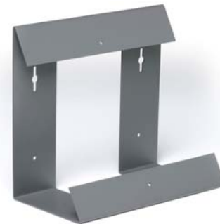
M7140 Angled Wall Mount Bracket

Linux® is the registered trademark of Linus Torvalds in the U.S. and other countries.